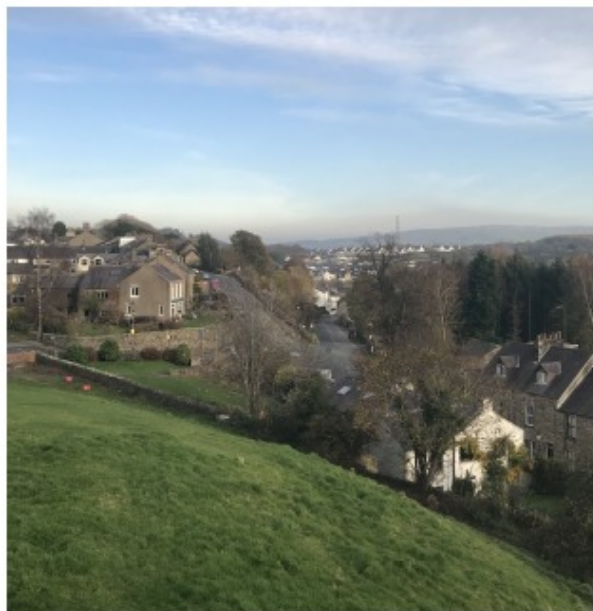
View of the old garden from Castle Hill October 2020